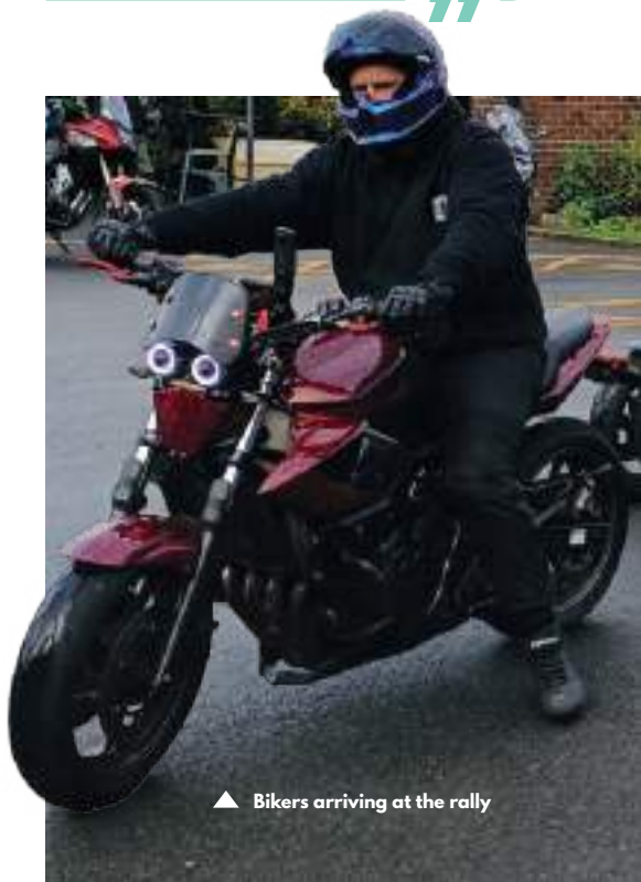
▲ Bikers arriving at the rally

The Hospice has been brilliant, everyone is really helpful.